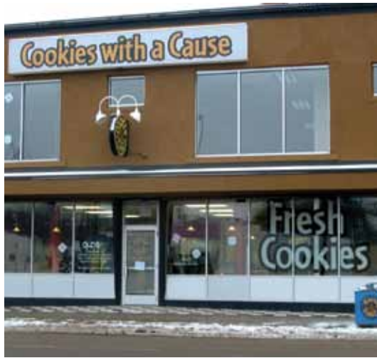
The Cookie Cart in North Minneapolis is a neighborhood source for great cookies and good jobs.

Also featured at the forum will be the documentary film Cornerstones: A History of North Minneapolis , produced by UROC in cooperation with Twin Cities Public Television.